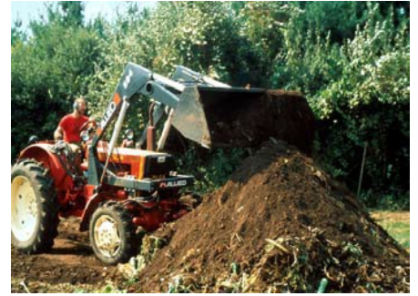
Turning your compost