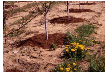
Using finished compost

If you have any questions about the composting process, state regulations, or solid waste disposal, please contact: