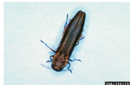
Fig 2. Adult twolined chestnut borer.