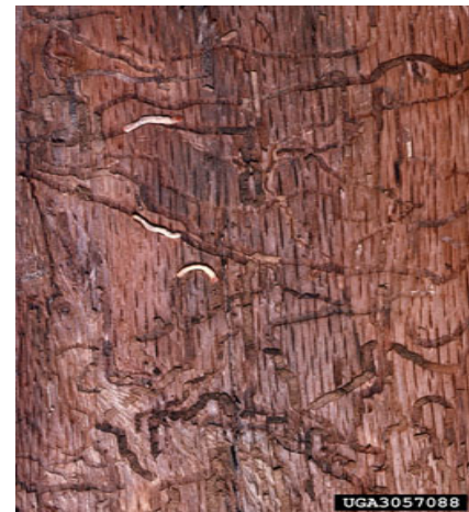
Fig 4. Galleries formed by larvae.

Due to numerous pesticide labels and/or label changes, be sure the product label includes the intended use prior to purchase or use. Please read and follow all pesticide label instructions and wear the protective equipment required. Spraying pesticides overhead increases the risk of exposure to the applicator and increases the likelihood of drift to non-target areas. Consider the use of a commercial applicator when spraying large trees due to the added risk of exposure and equipment needs. The mention of a specific product name does not constitute endorsement of that product by the South Dakota Department of Agriculture and Natural Resources .