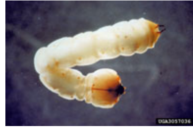
Fig 3. Larvae of twolined chestnut borer.

feed on the cambium layer between the wood and bark throughout the remainder of the summer. This feeding produces zigzag galleries under the bark, which, if numerous, can girdle and eventually kill the tree (Fig. 4). Larvae burrow into the outer bark and construct individual chambers to over-winter. The pupa stage occurs in the spring and new adults emerge to renew the cycle. The Twolined chestnut borer produces only one generation per year but may have a two-year life cycle in declining trees at the northern edge of the beetle's range.