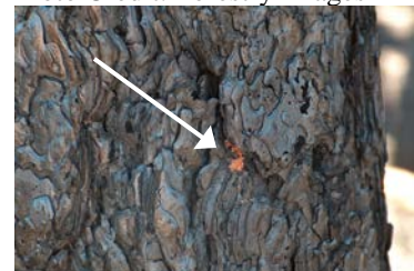
Ips boring dust on a scorched ponderosa pine.