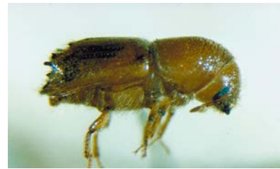
Enlarged picture of Ips beetle.