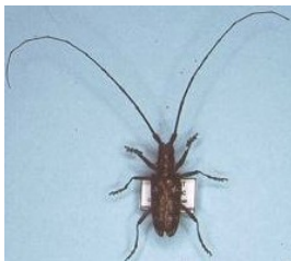
Adult sawyer beetle.

If the fire killed the trees, they are still attractive to a number of other insects, most importantly the longhorned or sawyer beetles. These insects attack standing dead or down trees and can quickly degrade the wood so that it no longer has any commercial value. The adults are gray, large-bodied (greater than 1-inch long) insects with long antennae that curl alongside the body, hence the name longhorned beetles. The adults leave small diamond-shaped egg notches on the bark and when the larvae hatch, the white, legless insects burrow into the wood. The number of insects that attack a tree as well as the appetite of the larvae – you can actually listen to them feeding - can result into a solid log become nothing more than a shell filled with wood shavings within a month or two following attack. Control of these insects is not by pesticide, but by prompt removal of infested trees. Landowners contemplating the commercial harvest of trees following a fire may want to contact a logging contractor as soon as possible.