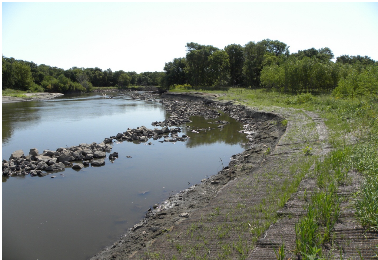
Figure 10. Failure at Site 406.

Phase 1 and 2 from the previous Segment handled the extra water without any major failures. These sites had higher top rock elevations and adequate time for vegetation to establish.