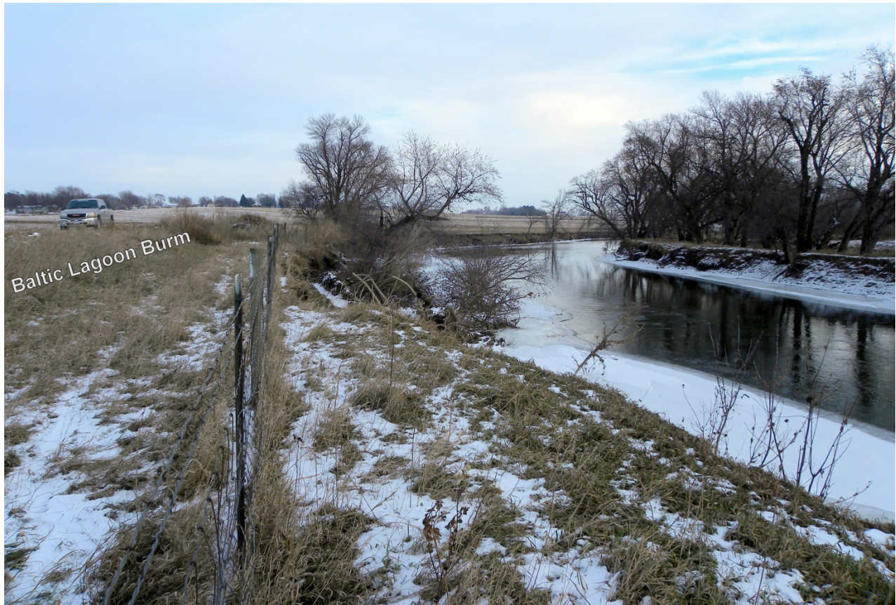
Figure 7: Baltic Lagoon Site before Construction.

Similar to Phase 1 and 2, two typical designs were used: spurs (Figure 8) and conventional Rip Rap (Figure 9). The top of the rock in either of these cases was only to reach the 1.5 year flow. Trees were planted on the exposed part of the bank between the rocks and top of the bank. This was to give the site extra protection years down the line. The land owner was also required to leave at least a 15ft buffer for cropland, but if the area was part of a pasture it was fenced off as well.