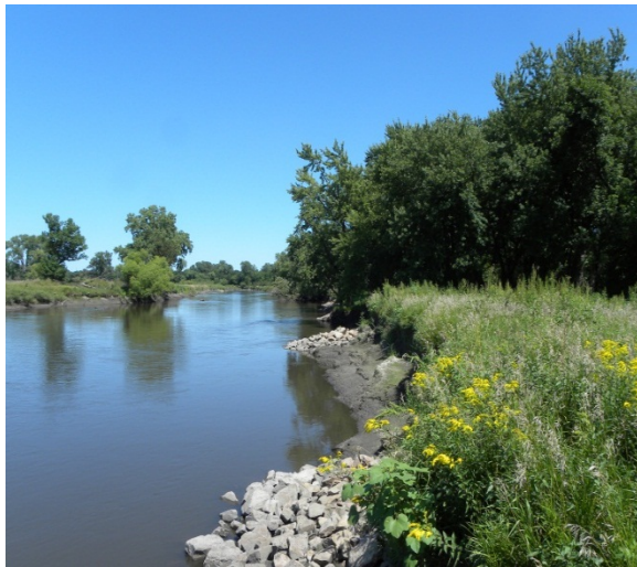
Figure 8: Site 104 Spurs.

Similar to Phase 1 and 2, two typical designs were used: spurs (Figure 8) and conventional Rip Rap (Figure 9). The top of the rock in either of these cases was only to reach the 1.5 year flow. Trees were planted on the exposed part of the bank between the rocks and top of the bank. This was to give the site extra protection years down the line. The land owner was also required to leave at least a 15ft buffer for cropland, but if the area was part of a pasture it was fenced off as well.