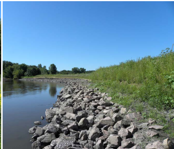
Figure 9: Site 14 Rip Rap.