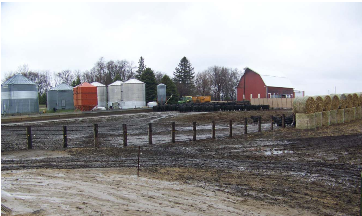
Figure 2: Open Feedlot.

The other producer with a completed feasibility report is planning to continue with design for a Vegetative Treatment System (VTS) and a mono-slope barn in the next segment. Figures 2 and 3 are pictures of the current operation with runoff leaving the feedlot.