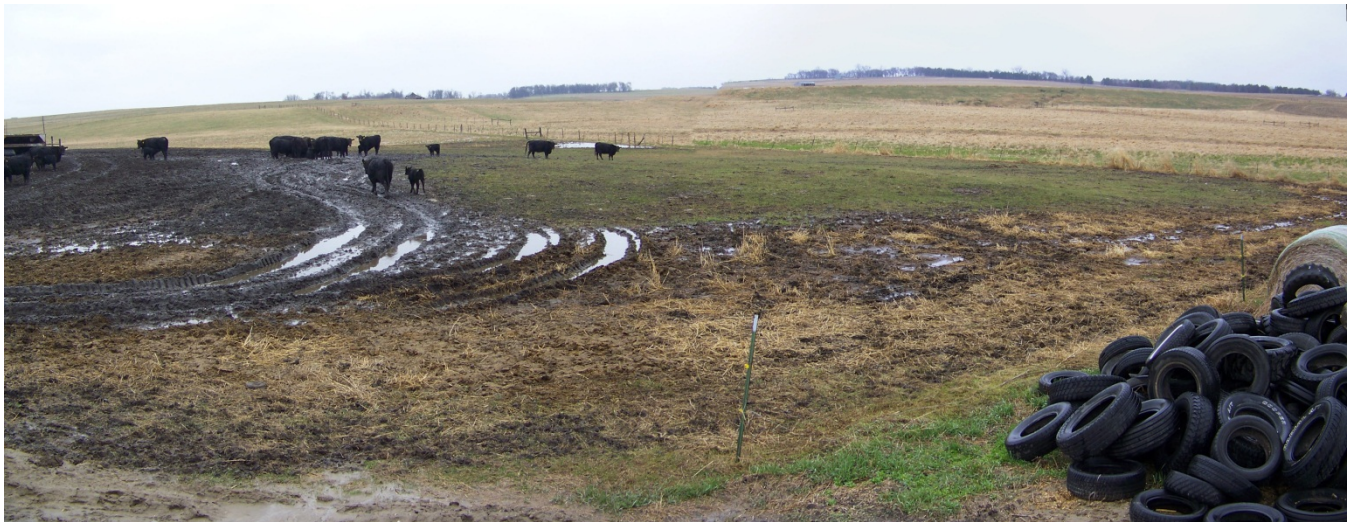
Figure 3: Runoff from open lot.

Task 2: Provide resources to livestock owners to limit or prevent access to impaired water bodies and provide alternative water sources to replace the impaired water bodies.