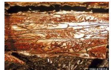
Pine Engraver Beetle Galleries

The mountain pine beetle is found throughout western North America from British Columbia to northern Mexico. It can be found throughout the Black Hills.