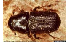
Mountain Pine Beetle

The mountain pine beetle ( Dendroctonus ponderosae ) is a small insect that lives most of its life in the inner bark of pine trees. The adult beetles are black to rusty brown and 1/4 inch in length. They fly from infested trees to new host trees in late June or July. Once they have located a favorable living host pine, the adults tunnel beneath the bark to lay eggs. After the eggs hatch the young, known as larvae, feed within the tree until the following spring when they pupate, a resting stage, for several weeks before becoming adults. The adults emerge from the dead, yet often still green, host and seek a new tree to begin the cycle again.