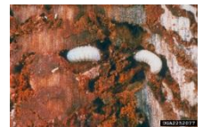
Mountain Pine Beetle Larvae

At this point the trees are usually beyond recovery. The following spring the needles on these attacked trees will turn a yellow to a bright red. The wood will show blue-staining by the fungus Ceratocystis montia . After the adult beetles emerge, the dead trees turn a dull red, becoming gray the following year. There are other insects and disorders that can be confused with some of the symptoms and signs of mountain pine beetle colonization.