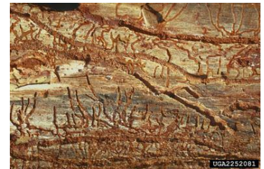
Mountain Pine Beetle Galleries

The pine engraver beetle often first attacks the tops of the trees while mountain pine beetle attacks are along the lower 3/4 of the tree. Mountain pine beetle attacks generally result in the formation of pitch tubes while pitch tubes are rare with pine engraver beetle attacks. The galleries created beneath the bark are different. Mountain pine beetles form one large gallery with many smaller ones constructed perpendicular from the main one. Pine engraver beetles have several large galleries radiating out from a central location.