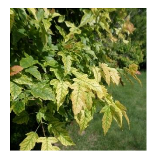
Chlorotic Amur maple leaves.

We typically see these symptoms appearing on Amur maple (Acer tataricum var ginnala), red maple (Acer rubrum), freeman maples (Acer x freemanii) swamp white oak (Quercus bicolor), river birch (Betula nigra), and silver maple (Acer saccharinium). This year I am also seeing symptoms