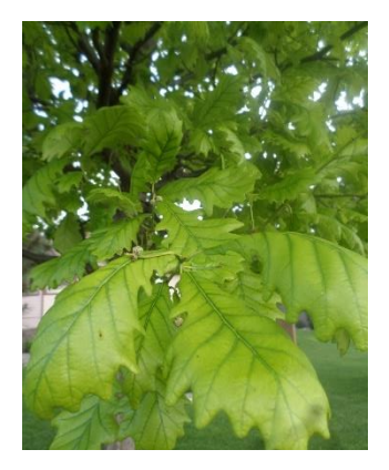
Chlorotic swamp white oak leaves.

If it is chlorosis due to a deficiency of either iron or manganese, the next step is to determine which microelement may be missing. Iron chlorosis is usually the missing microelement if the newest foliage, the leaves on the tips, are turning yellow with the veins remaining green. If the older, interior foliage is turning chlorotic then it most likely is manganese. It is also possible for a tree to be lacking both micro-elements.