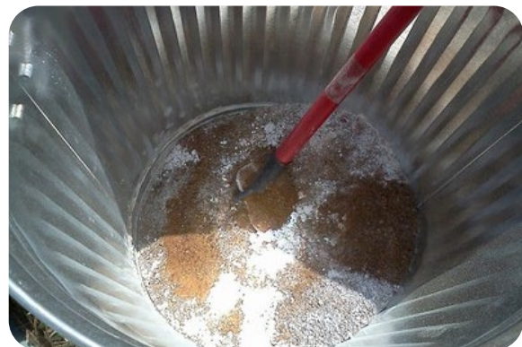
Photo 3- Mixing of Granular Fertilizer

Retail sales of anhydrous ammonia, to be used as fertilizer, are eligible for the Retail Fertilizer Exemption.